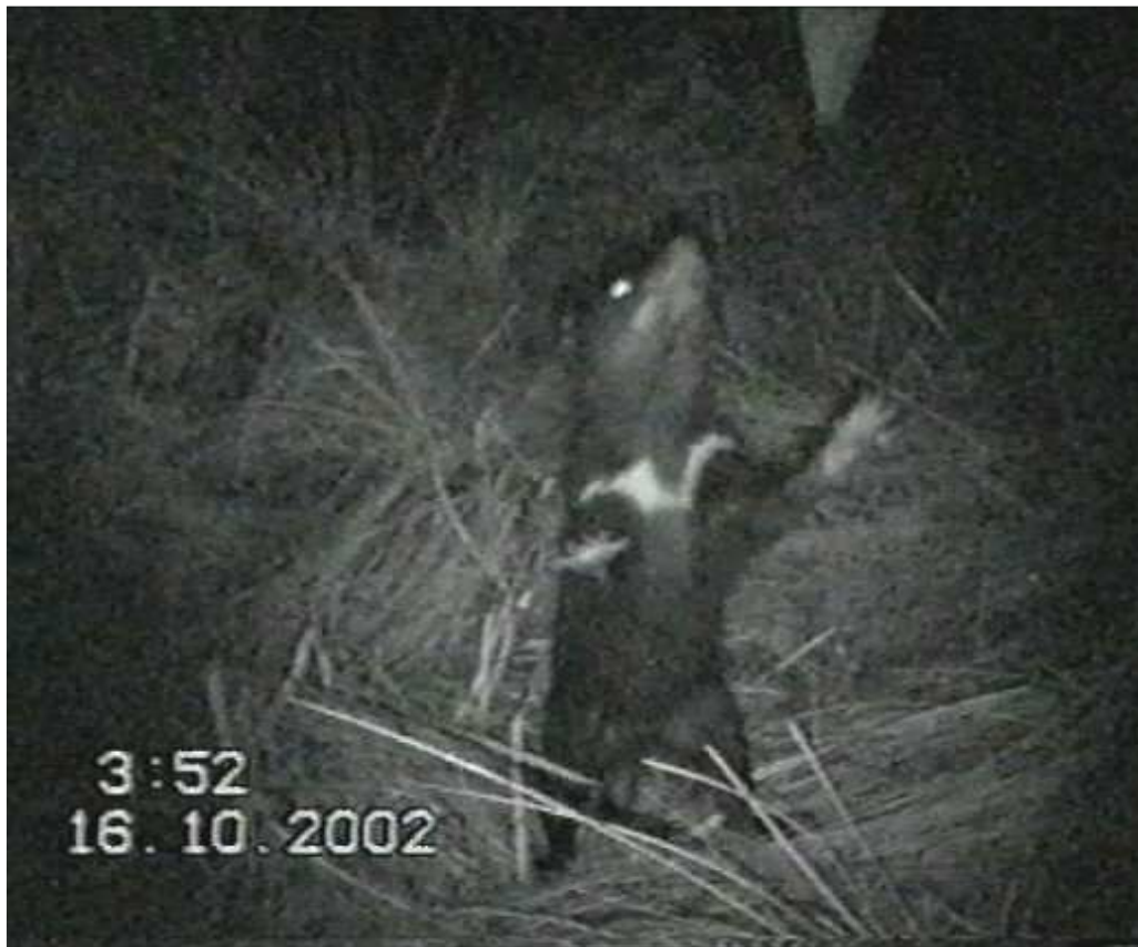
Plate 2. Tasmanian devil trying to reach a suspended bait; still from an infra-red motion activated automatic video camera image

Title is "Magnificent Survivor, Continued Existence of the Tasmanian Tiger". That prompts two areas of discussion; A) the fact that the thylacine does exist now, and also B) what is required to allow continued existence into the future. I have thus divided the book into two parts, with a third part offering comment from two leading thylacine advocates of our day.