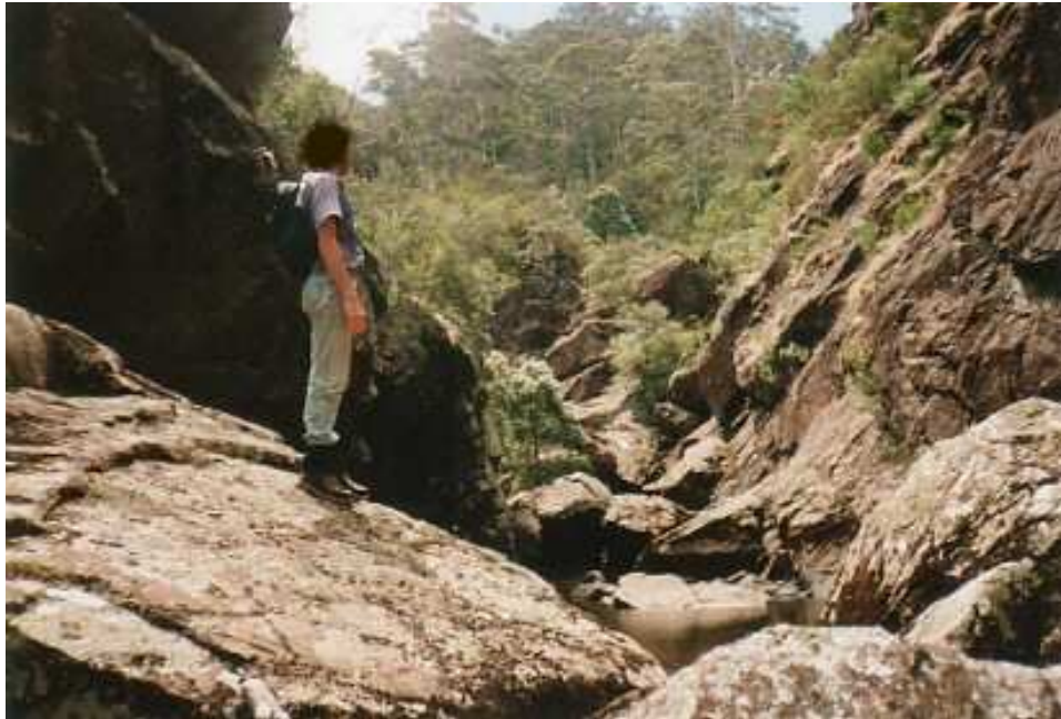
Plate 1. "Devils Whirlpool"; mid east coast Tasmania

This is a time of enormous change, and there are damaging forces of greed and apathy at work in Tasmania which the rest of the world either does not know, or does not care about. The old guard of colonial ignorance has almost died, and with its passing we welcome a new day of understanding and appreciation for native wildlife. Appreciation and hence protection comes from knowledge, but today there is a veil of secrecy smothering the Tasmanian tiger. That species was unforgivably persecuted in the past, and I tell you this is still happening today.